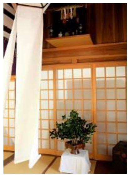
Reika – Camellia (single-variant); by Shoka Arashi Vessel: Decorative 4-legged square ceramic vase (legs attached)

"Adorning of the Three-Headed Daikokuten"